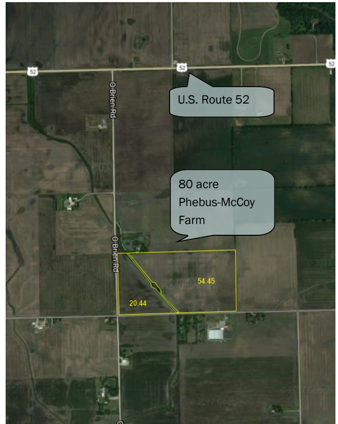
Lines are approximate for illustration only.

Contact us at (815)-936-8978 for more details and a complete brochure.