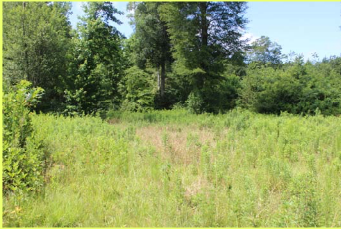
View South of Food Plot