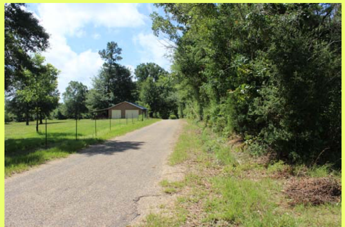
View South of D.K. Mansfield Rd.