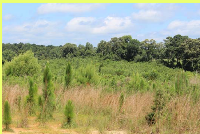
View West of Tract