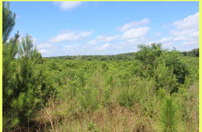
View of Tract