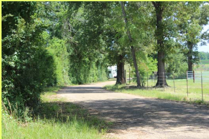
View North of D.K. Mansfield Rd