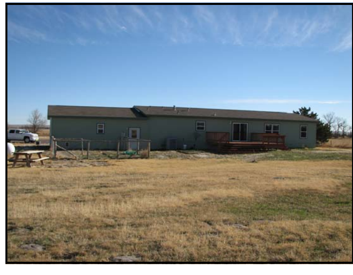
Back of house with dog run & redwood deck