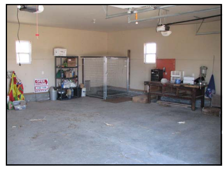
Large garage with dog kennel