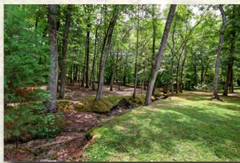
Fig & Pear Trees