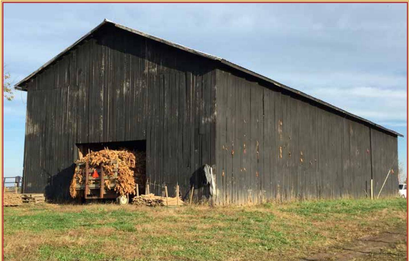
•Ten Bent Tobacco Barn