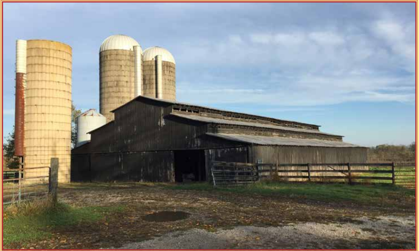
•Tobacco/Stock Barn with Silos