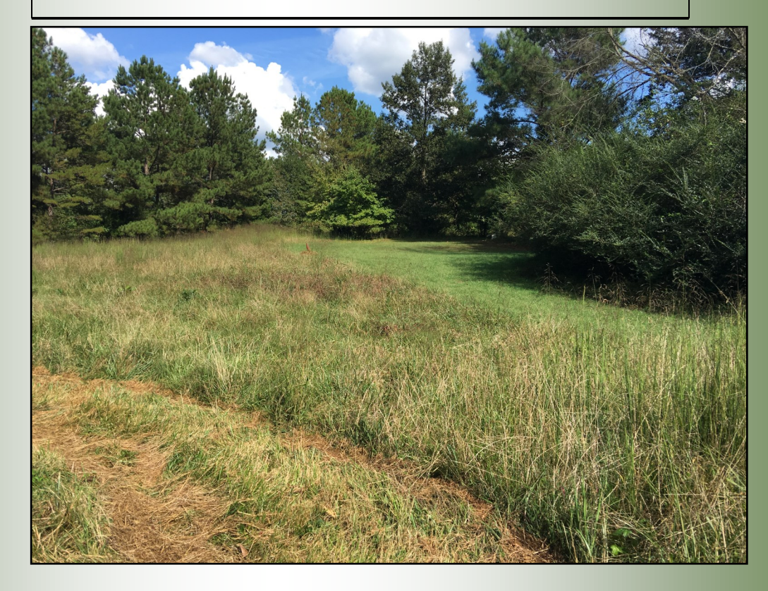
10 Acres | 1098 Double Bridges Rd | Clarke County, GA | 30683