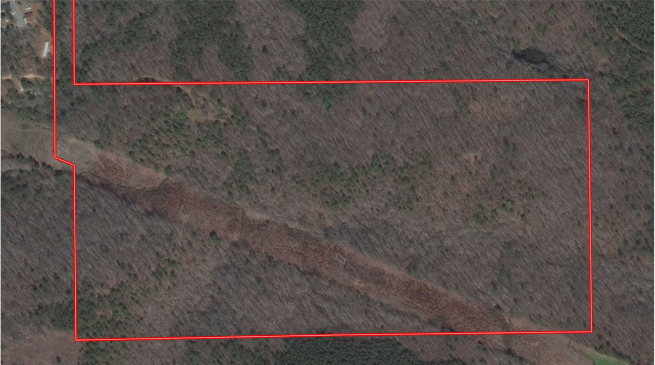
Collins Lane Tract Coosa County, Alabama, 85 AC +/-