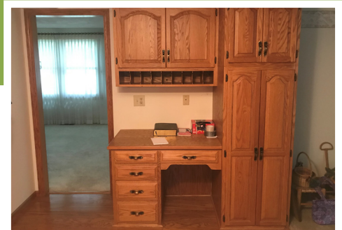
DINING ROOM 2