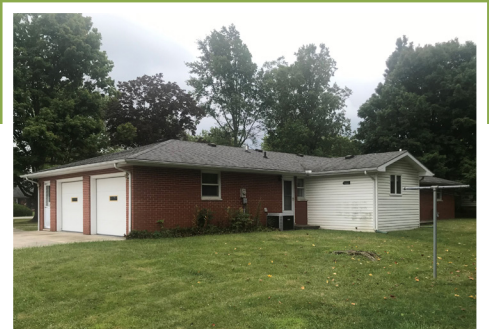
BACKSIDE OF HOME