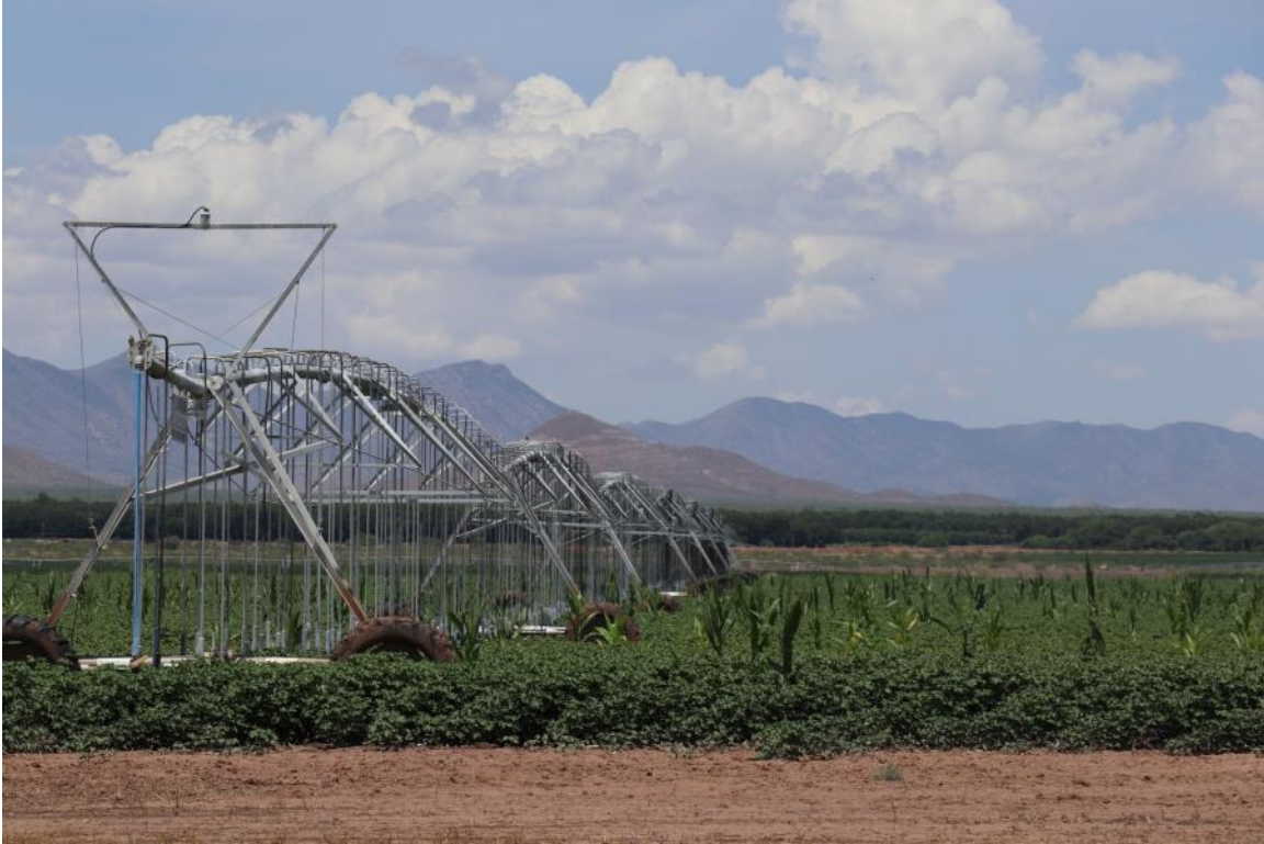
2019 cotton crop