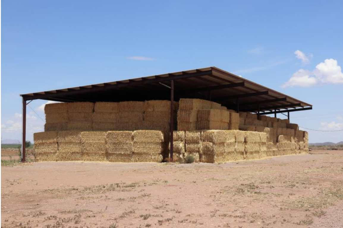
Hay barn, 60' x 150' under roof