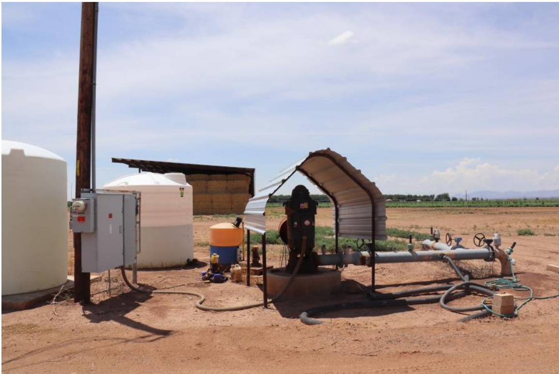
Well No. 1, 1030' deep, 12" casing, 150 Hp, 750 GPM