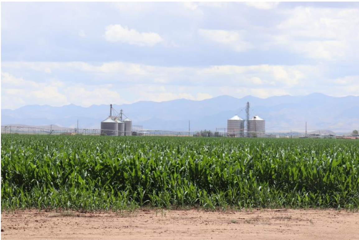
2019 corn crop